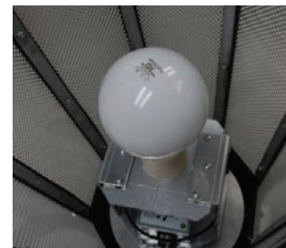
With New Lamp System