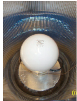
With New Lamp System