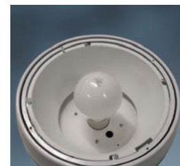
With New Lamp System

phone: 815-315-8883 fax: 847-470-9828 quotes@inductionlighting.com