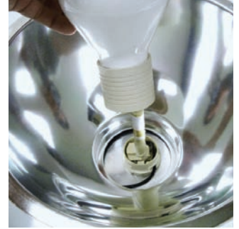
With New Lamp System