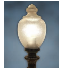
With New Lamp System